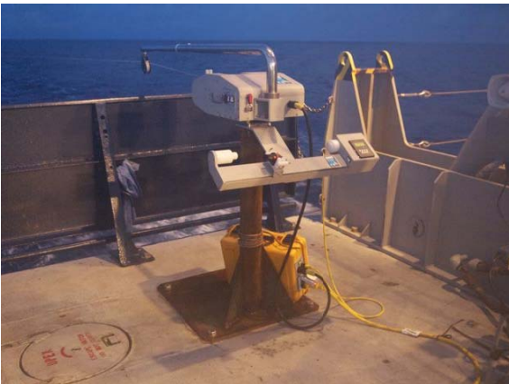
Figure 1. Series II UCTD Installed on R/V Roger Revelle, during probe recovery.

ITOP UCTD was equipped with the unique tail spool reloading system to enable line to be paid out simultaneously from the probe as it drops and the winch on the ship. The tail spool reloading procedure can be seen in Figure 2, prior to an 850m cast. The tail spool seen on the rewinder is attached to the CTD probe using a special coupling prior to “freefall” deployment.