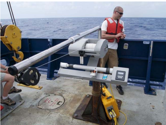
Figure 2. Series II UCTD performing the tail spool reloading procedure.

The cruise track and the location of the 2,917 UCTD casts can be seen on Figure 3. Typically UnderwayCTD profiles were conducted every 1km.